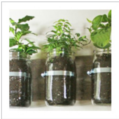
Get Cooking With An Easy Herb Display