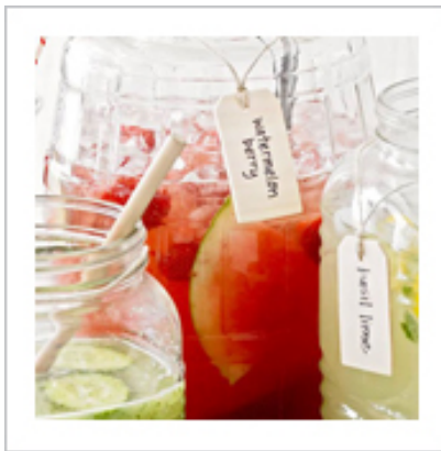
Try This Fun, Fresh Idea For Lemonade