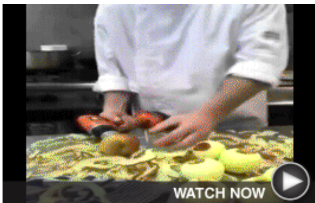
A Very A-Peeling Technique