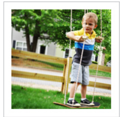
Kids Will Flip Over A Skateboard Swing

You haven't started pinning on Pinterest yet and you want to get started? If so, click here .