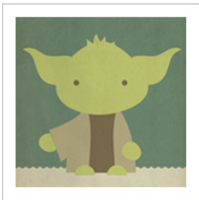
Make Yoda Valentines With Glow Sticks