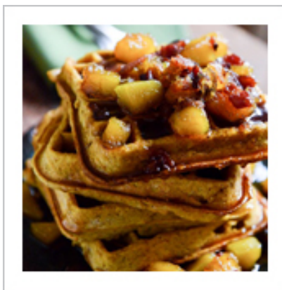
Pumpkin Spice Waffles & Butternut Bacon Syrup