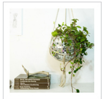
Have A Ball With A Cool Disco Ball Planter